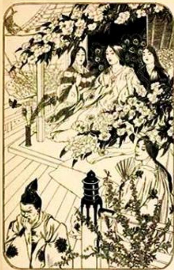
One after the other returned successfully home, for none found sorrow in her eyes.