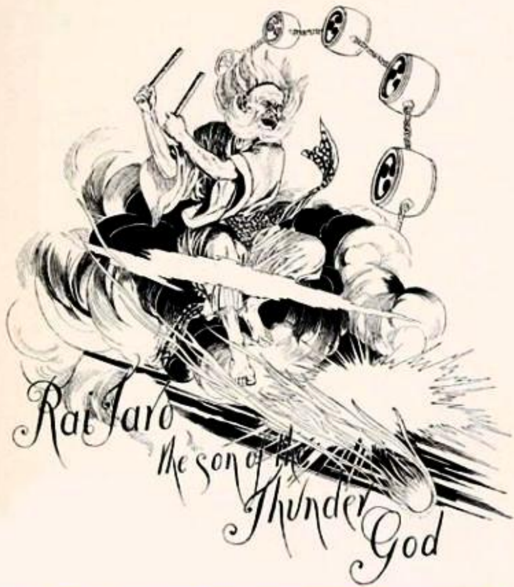
Rai Juro the son of the Thunder God