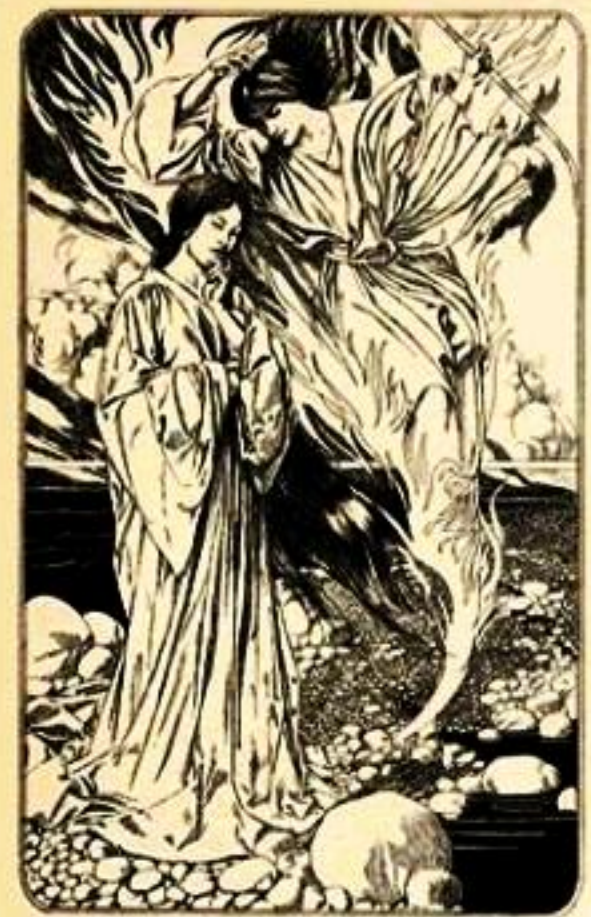
As the Young Prince alighted on the sea-shore, a beautiful earth-spirit, Princess Under Shining, stood before him.