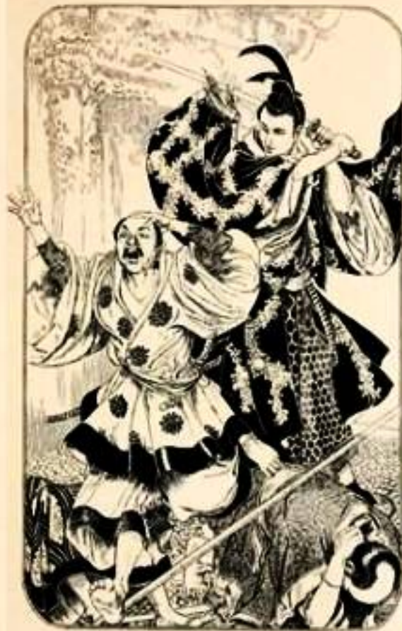
With two mighty strokes, he felled his admirer to the ground.