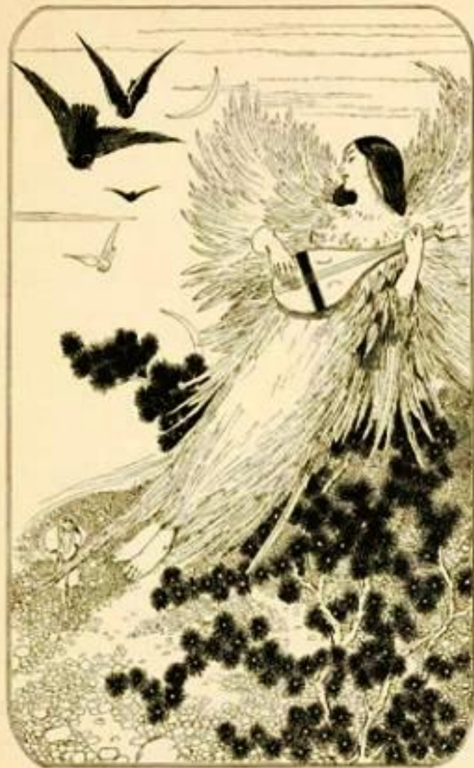
At one moment she skimmed the surface of the sea, the next her tiny feet touched the topmost branches of the tall pine trees.