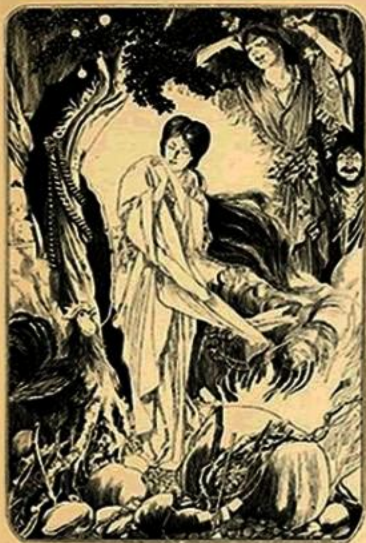
Amaterasu gazed into the mirror, and wondered greatly when she saw therein a goddess of exceeding beauty.