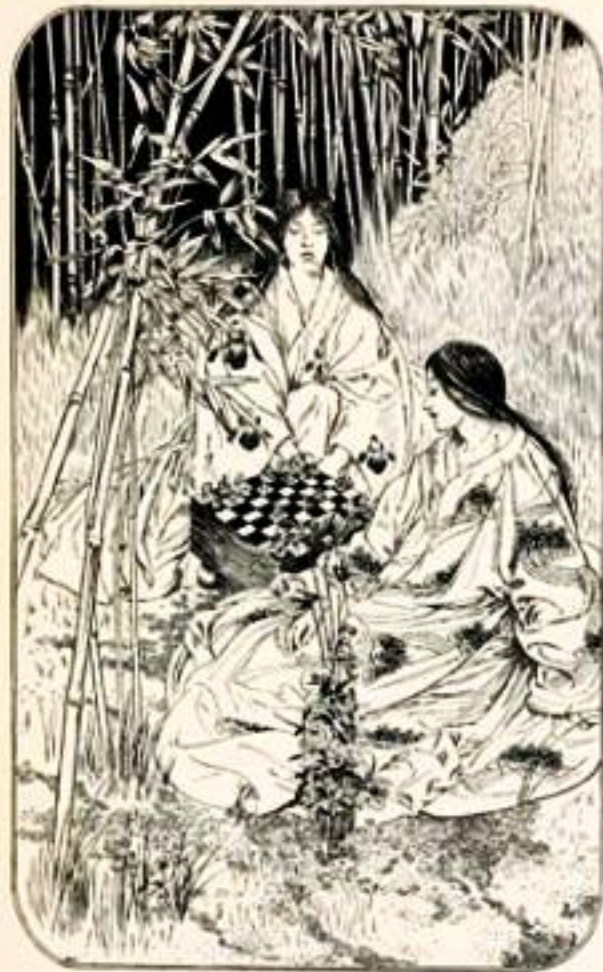
On a plot of mummy grass beyond the thicket, sat two maidens of surprising beauty.