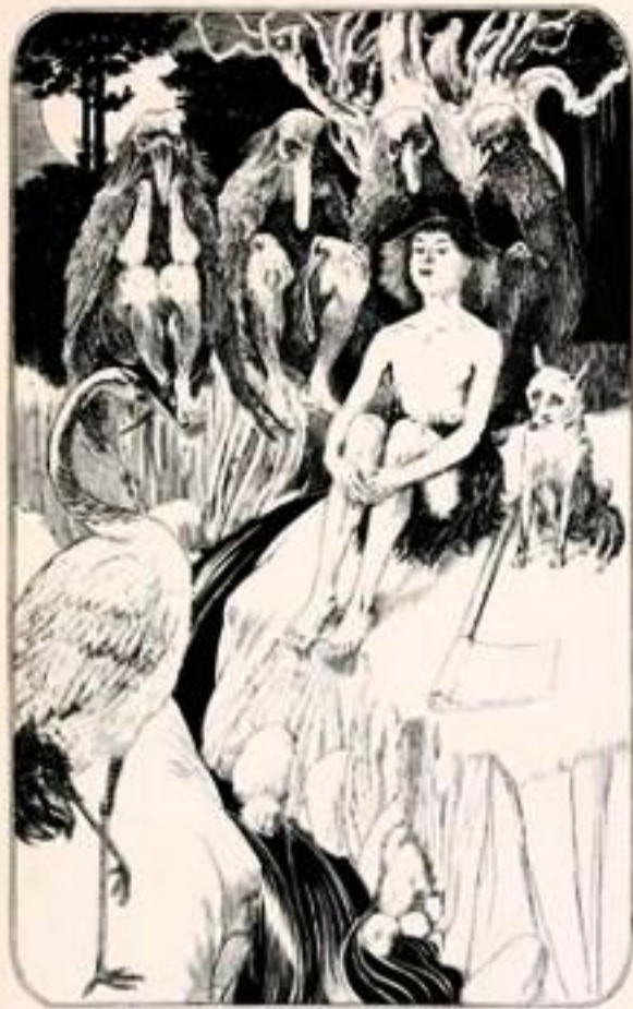
Kikaku reigned as patron of the forest, beloved of every living creature.