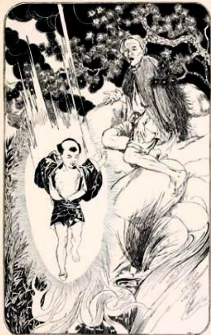
The birth of Rai-ten.